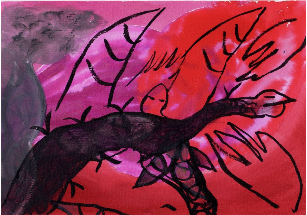
redfox and snake

That night, Puppy dreams of its grandma's voice. It is in a room where it hasn't been before. The phone rings. Puppy picks it up and hears the familiar tone. They stay on the call for a long time, without having much to say, but just being content that they are sharing the moment. At one point, Puppy asks its grandma what she is doing this evening. "Nothing," she replies. Puppy suggests that it come over to her house that evening. She is happy to hear this and tells Puppy what she will prepare for dinner for it. Puppy feels a calm happiness sinking down into its body.